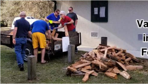
Vanners in the Forest