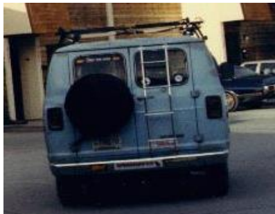
Parades - pic of chopped Beach Van "Beach VAN" 1977 Mid Dodge 318 V8