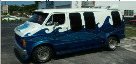
"Beach Buggy" 80s Chevy Astro