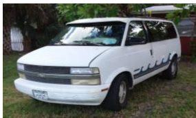
Daily driver gets a roof... Current "Beach VAN" 90s Astro