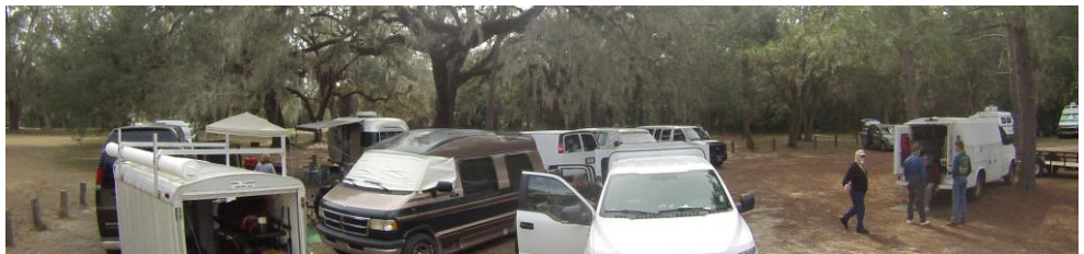
Vans, Vanners, Campsites