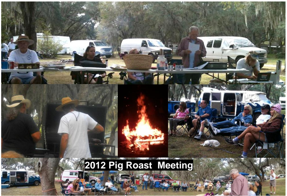
2012 Pig Roast Meeting

Broward X-Mas Party → Deep fried turkeys - both of them!