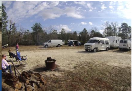
New Years at the Chester Ranch