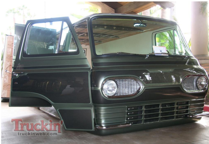
CofC 2011 Buena Park, CA – Van Show - “VanGo”